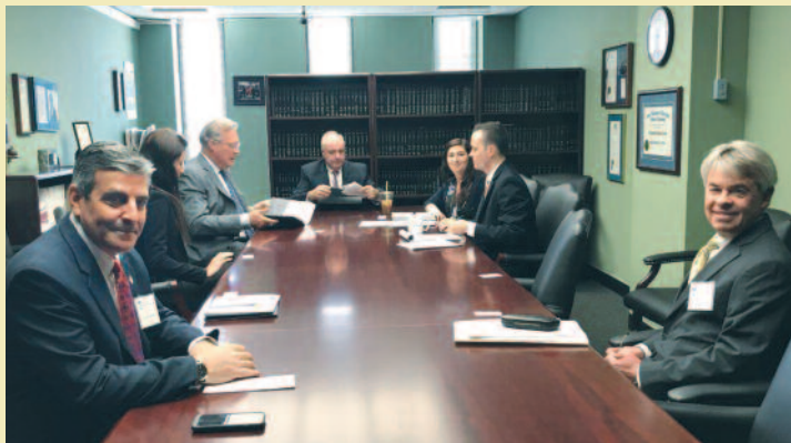
NYSSA members held productive meetings with legislators and their aides.