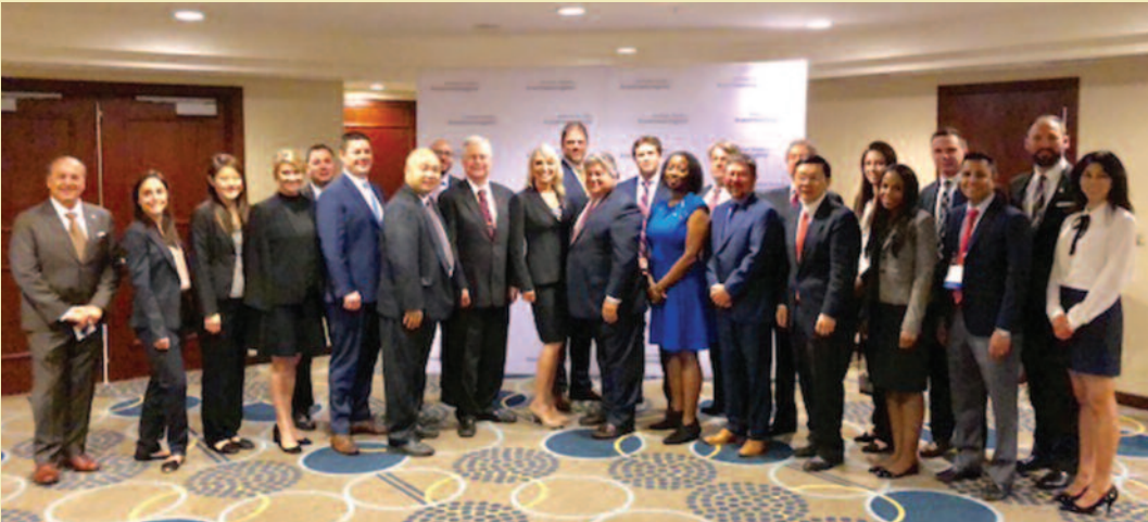
NYSSA delegates took time for a photo during the ASA legislative conference.